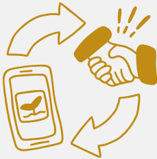
FARMER SUPPORT & TRAINING P. 57